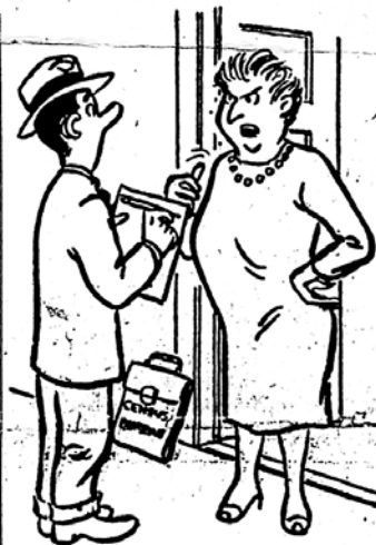
Forget about my age, Bub: just COUNT me!

Actually, 200 questions make up the census questionnaire, but not every one will be asked of every citizen. Some of the queries that will be asked from the Mississippi Delta country to the Arctic circle, from the Maine lobster pots to the smudge pots of California orchards concern place of birth, education, type of employment, salary, number of times married, number of children. There will be questions about housing: number of rooms, number of people living in house, kind of sanitary facilities, value, state of repair, year in which built. You may even be asked if